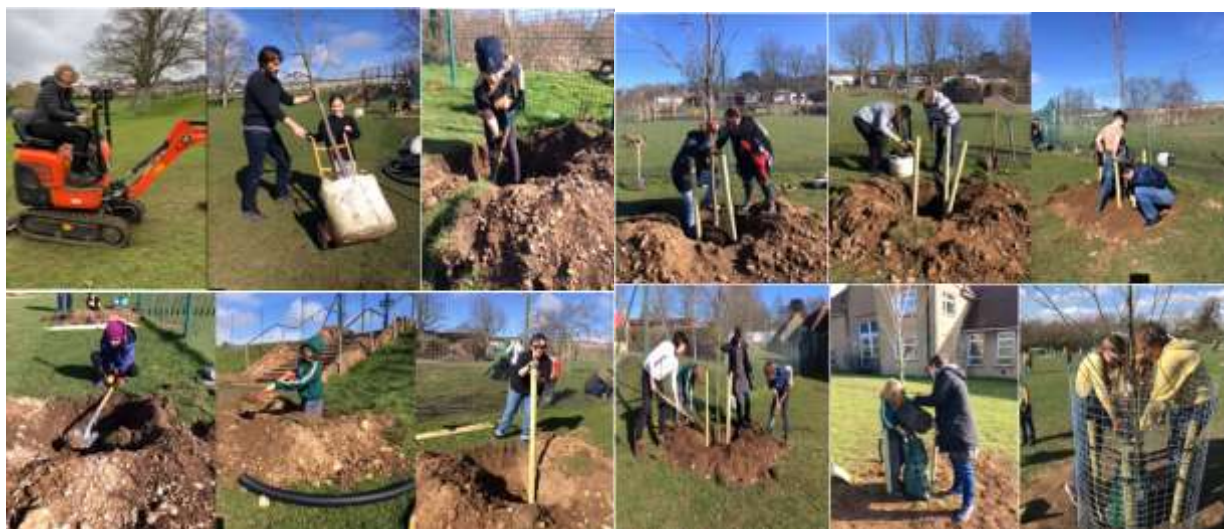
Planting of the first 12 trees 12/03/22

Where did the money come from? The trees have been funded by the UTCF. The Urban tree Challenge fund from the Forestry Commission pays for trees to be planted in Parks and open spaces (not streets) and covers their establishment costs for 3 years. Brighton and Hove City Council has provided stakes, wire and contractors to do the hole digging. Through this fund, Brighton and Hove Green Spaces Forum, (which is a citywide group incl us) will have successfully planted over 400 semi-mature trees around Brighton and Hove by the end of this November!